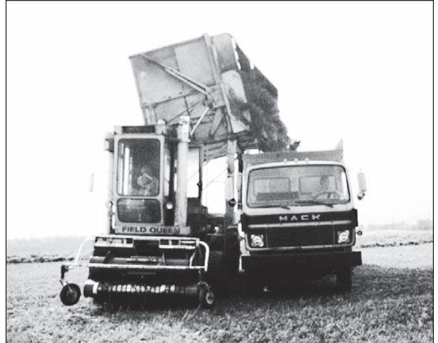
Production of silage has been relatively easy to mechanize.

Regardless of the amount of capital invested, the purchase and subsequent use of expensive silage-making equipment will not improve forage quality. Forages harvested at advanced stages of maturity will always be poor in quality. To make high-quality silage, producers always must start with high-quality forage.