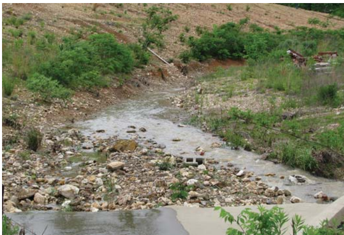
Figure 2. Unprotected waterways are vulnerable to degradation.

avoided. All of these attributes help to maintain or improve water quality within the landscape.