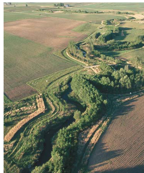
Figure 1. A riparian buffer.

Riparian buffers are strips of vegetation established next to waterways in managed landscapes and are designed to capture runoff, nutrients and sediment and to restore a more natural aquatic environment. Riparian buffers typically range in width