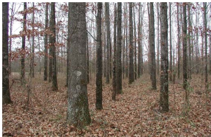
Figure 5. Riparian forest buffers can be managed for timber production.

Often there is a misconception that land put aside for riparian buffers is no longer productive and therefore does not generate an economic return. This notion could not be farther from the truth. Portions of riparian buffers that include a forested component may be managed for timber production and are often more productive than drier upland forests (Figure 5).