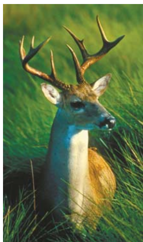
Figure 4. Riparian buffers greatly improve wildlife habitat.

growth of juvenile smallmouth bass has been found to decrease with water temperatures above 86°F. Wind speed and humidity are also altered by riparian vegetation. Removal of forested riparian vegetation leads to an increase in wind speed and reduction of humidity which may have negative impact on aquatic and riparian communities. Therefore, it is recommended that managed forests include streamside management zones (SMZs) that reduce management activity in strips of existing forested areas adjacent to streams. Establishing forested riparian buffers in