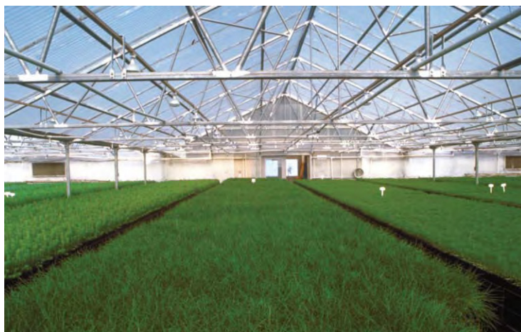
Figure 1. A wide and confusing variety of loblolly pine seedlings is available to forest landowners.

So, what is the right seedling for you? This fact sheet is designed to help you make an informed choice based on your goals and resources (Figure 1).