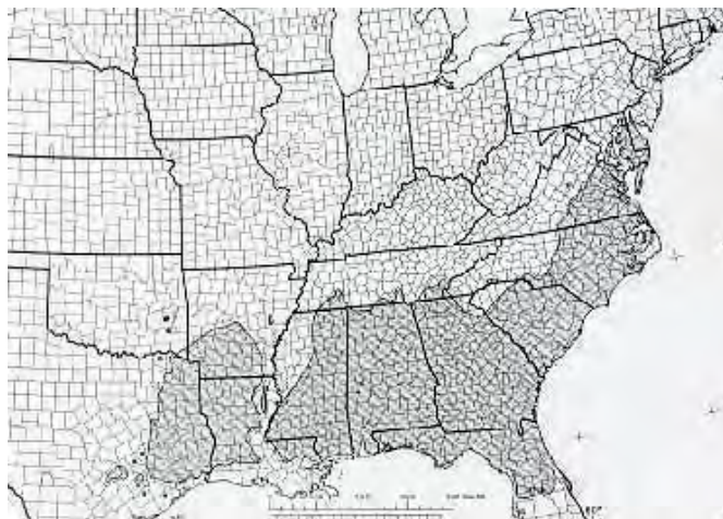
Figure 3. The natural range of loblolly pine includes most of the Southeast and covers a wide variety of climates and habitats.

Plants that have wide geographic distributions have regional races that are adapted to local climatic conditions. Like many other plants, loblolly pine has these regional races that differ in growth rates, disease resistance, cold tolerance and drought resistance (Figure 3). In general, Atlantic coastal plain loblolly pines from the Carolinas grow more