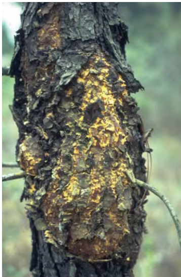
Figure 9. If fusiform rust is a problem in your area, be sure to purchase trees from families with proven resistance.

If fusiform rust has been a problem in the past, select a variety from the western gulf coast or an Atlantic coast variety from loblolly pine families known to be resistant to fusiform rust. If you are unsure about the risk of fusiform rust in your area, contact your county Extension agent or your local Arkansas Forestry Commission county office and ask.