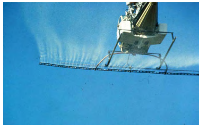
Figure 6. There are many ways to apply herbicides. Select application equipment based on site and timing.

Competition control can be accomplished through several means, but timing and specific treatment will depend upon what competition you are battling (Figure 6). Woody competition is best controlled through effective site preparation before the trees are planted. Herbaceous competition usually is controlled after the trees are planted. Mowing and herbicide application are the two most practical means of herbaceous competition control. Herbicide application is the simplest and cheapest method of competition control, but herbicides can have some undesirable effects on native ecosystems. Some sites contain native plants that are rare and need to be