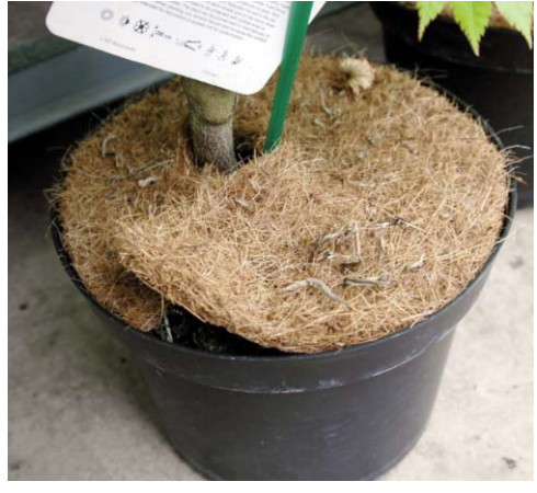
Coco fiber weed disk

Disks cover the media surface and form a physical barrier through which weeds cannot penetrate, but they still allow water, air and nutrients to penetrate into the container media. Examples include geotextile disks (e.g., Tex-R-Geodisc<sup>TM</sup>), coco fiber and plastic. Concerns with these materials include cost and the ability to keep these products on the media surface during windy conditions. These products often leave a gap around the container edge or near the stem that weeds often exploit.