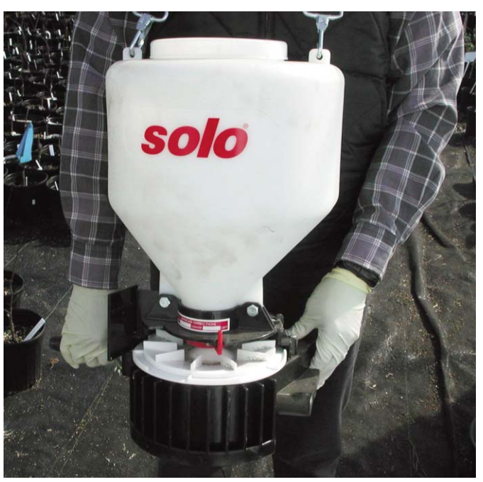
Typical belly-grinder applicator for granular herbicides

To be most effective, preemergence herbicides should be applied to a media surface that is free of weeds. Read and follow label directions carefully, as some products may recommend a waiting period before applying the chemical following canning or transplanting. In Arkansas, two to three applications are required during a growing season.