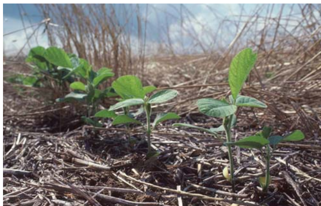
FIGURE 3. Soybeans growing in wheat stubble.