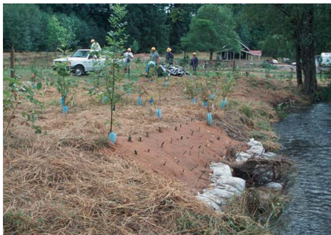
FIGURE 4. A streambank stabilization project at various stages of plant growth with cost-share funding through the Wildlife Habitat Incentives Program (WHIP).

A general, multi-purpose streamside buffer design consists of a 50-foot-wide strip of grass, shrubs and trees between the normal bank-full water level and cropland. Trees spaced 6 to 10 feet apart occupy the first 20 feet nearest the stream, shrubs spaced 3 to 6 feet apart dominate the next 10 feet, and grass extends 20 feet further out to the edge of the crop field. Planting trees and shrubs in well-spaced rows makes maintenance activities, such as mowing, easier to do. This design requires 6 acres per mile of stream bank, or 12 acres if installed on both sides of the stream.