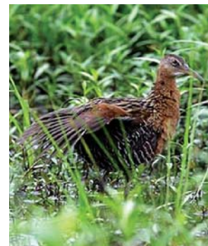
FIGURE 2. The secretive King Rail is a type of waterbird found in Arkansas which nests in weedy rice fields and adjacent ditches.

Many thrive on seeds or invertebrates attracted to decaying plant material. Some, like the American White Pelican and Double-Crested Cormorant, eat fish and can come into conflict with aquaculture production. However, most are beneficial to agriculture in reducing weed seeds and insect pests or