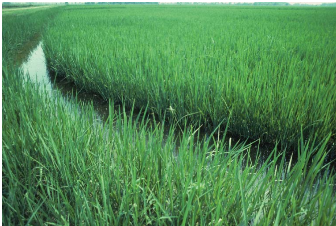
FIGURE 5. Irrigation ditches provide habitat for waterbirds.