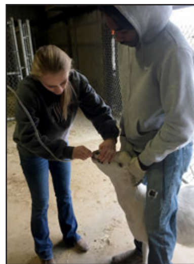
Tubing a goat.

Abomasal bloat, sometimes called abomasitis, is a disorder seen in lambs and kids that are generally under three weeks of age. Several factors, including