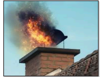
Figure 5. A typical chimney fire ( https://mffire.com/prevent-chimney-fires )