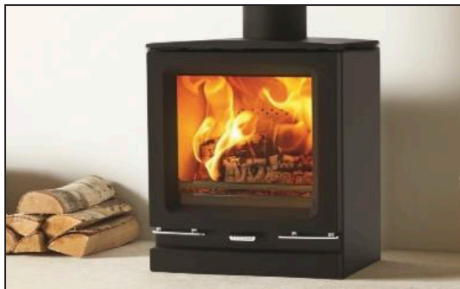
Figure 4. An advanced combustion design stove