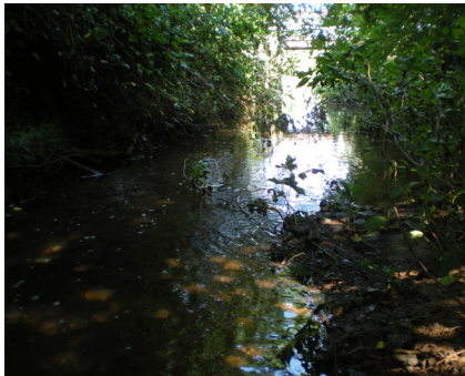
A well-shaded stream has more dissolved oxygen content. A stream with highly dissolved oxygen is also a stream with desirable fish and other aquatic species.

Stream shading is important for providing water temperature regulation and dissolved oxygen for aquatic organisms such as fish and crawfish, among others.