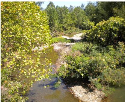
A healthy channel most often will have densely vegetated streambanks, few vertical banks and will not change much after a flood.

Stream channel condition refers to the amount of deterioration that has occurred in the stream and riparian areas as a result of streamside management and other land use practices within a watershed. A healthy channel will be able to convey high flows without eroding away, provide wildlife habitat and be densely covered with vegetation extending up the streambank and out into the riparian area.