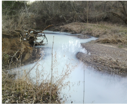
A stream that appears to have some chemical pollution present.