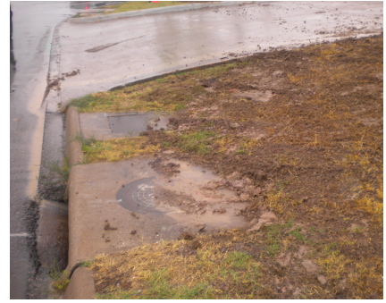
Sediment in streams can come from many places, but often the source can be found with simple investigation.