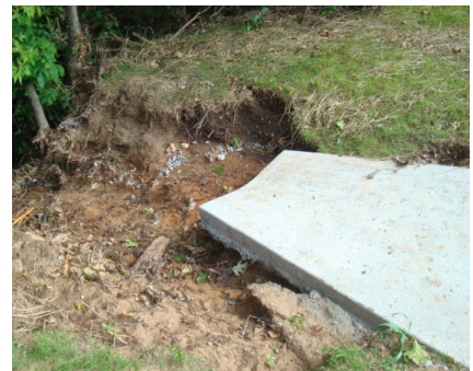
Runoff delivered to a creek by level spreader with no riprap protection or vegetative filter strip will deliver pollutants and become an erosion problem before entering a stream.