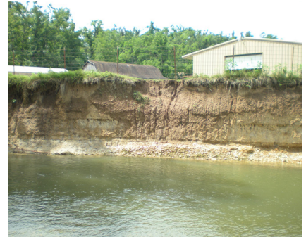
A highly unstable streambank has little to no vegetation and a vertical bank.