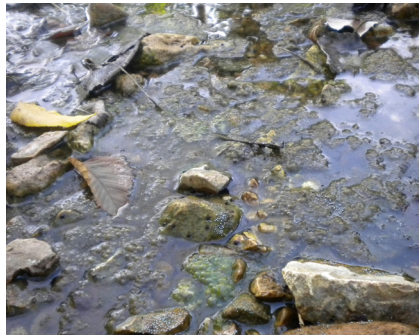
Green algae are common to all fresh water in Arkansas and can become problematic with enough light and nutrients.