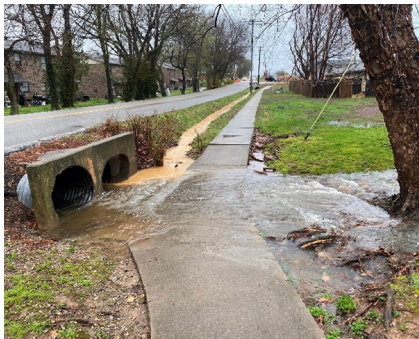
This picture displays muddy water coming from a development site just up the block during a rainfall event. Notice that the bigger stream is not as muddy as the water flowing in the stormwater drainage ditch. Sediment is the number one form of pollution to surface waters in Arkansas and across the United States.