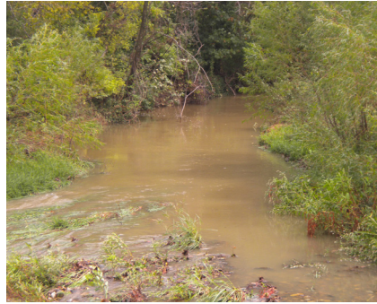
This stream became muddy after a rainfall event. Just because a river is rising doesn't mean it should become muddy.