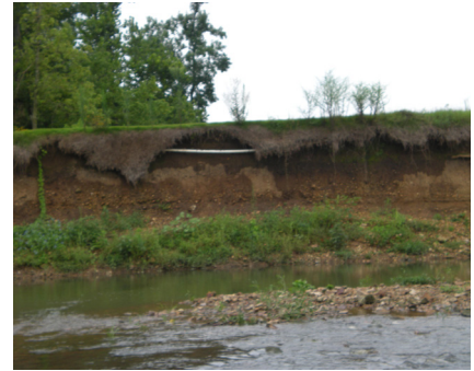
A streambank stripped of its natural protective vegetation and without any type of restoration is completely unprotected and highly erosive.