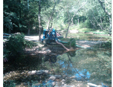
Too much water withdrawal or removal from a creek during low-flow periods can harm aquatic wildlife and take away other downstream uses of water.