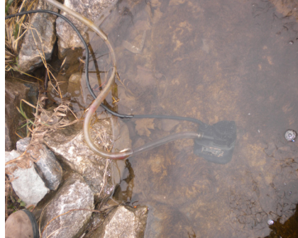
Water removal from a riparian area can potentially be excessive and lower the amount of water available for use by aquatic organisms and alter water chemistry.