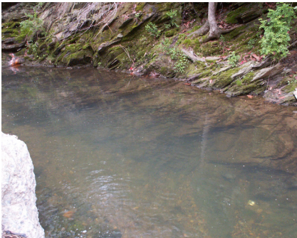
Planktonic algae are common to all fresh water in Arkansas and can become problematic with enough light and nutrients present.

Algae is a normal part of any healthy stream, but there can sometimes be excessive algae growth in a stream. When algae growth is excessive, fish kills can occur and recreational uses can be limited. When algae growth is excessive over a long period of time, species composition shifts; desirable game fish populations such as bass can be replaced by undesirable non-game fish like sucker fish. Excessive algae growth is usually attributed to excessive amounts of nutrient loading from sediment and fertilizer runoff or excessive amounts of sunlight resulting from degraded or nonexistent streambank vegetation and associated riparian area vegetation.