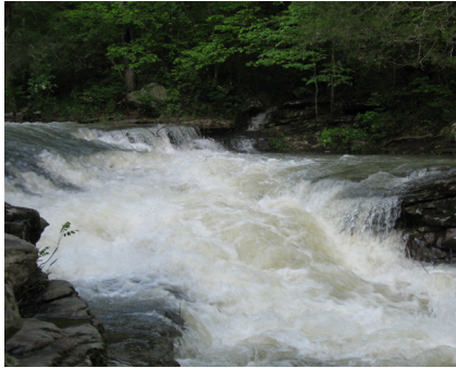
This stream did not become muddy after a rainfall event. Streams should not become muddy due to a rainfall.

Sediment is the number one contaminant of surface waters in the United States. If you see muddy water in your creek during low-flow conditions, you should easily be able to walk or travel along the stream to see the source of muddy water. If the stream is in bank-full or flood stage, it will be much more difficult to determine the source of the sediment, but it is still possible to search your property and other places in the watershed to determine where the sediment is entering the stream.