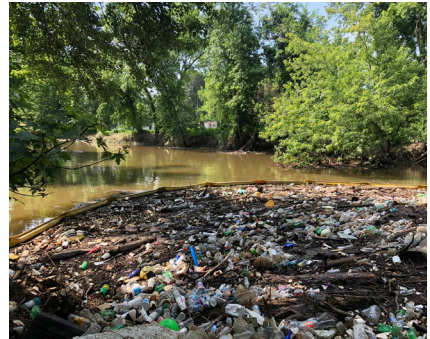
A stream that appears to have some litter pollution present.