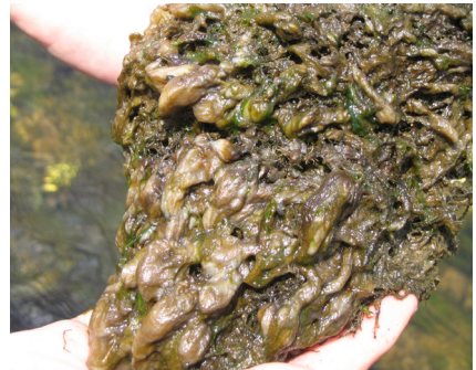
Didymo, also called "rock snot," is an invasive freshwater algae that is problematic in Arkansas streams.