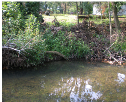
A vegetative/riparian buffer that is thin, not diverse or dense with vegetation is moderately healthy and likely to have some wildlife present.