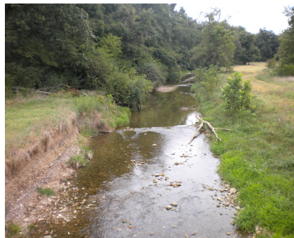
A moderately healthy channel will have some vegetation on the streambanks, some vertical banks and some changes after a flood.