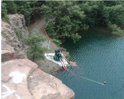
Water removal from a riparian area is the right of a riparian landowner. In this case, there is plenty of water for withdrawal without taking water away from a downstream use.

Water removal from a stream is a legal right of a streamside landowner, as long as enough water is left for other downstream uses. If all of the water from a stream is removed, it is not good for other downstream water users or for the terrestrial and aquatic wildlife.