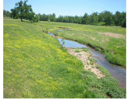
An empty floodplain will not allow items to be damaged or washed away by a flood.