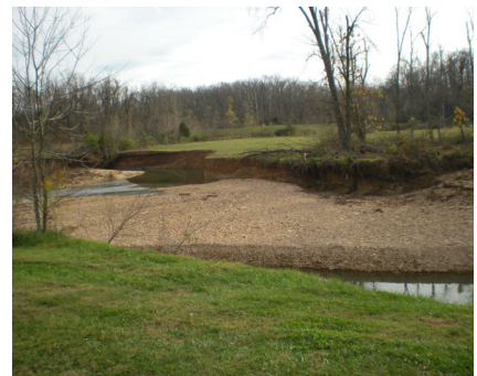
An unhealthy channel will not have much vegetation on the streambank, lots of vertical banks and will change with almost every flood.