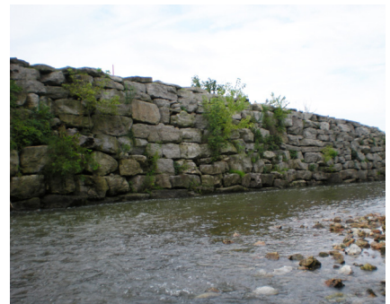
A vegetative/riparian buffer that is nonexistent is unlikely to have any wildlife present.