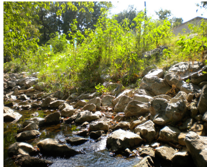
Riprap placed at the bottom of a re-sloped bank with vegetation added for increased beauty and strength will not likely have to be replaced.