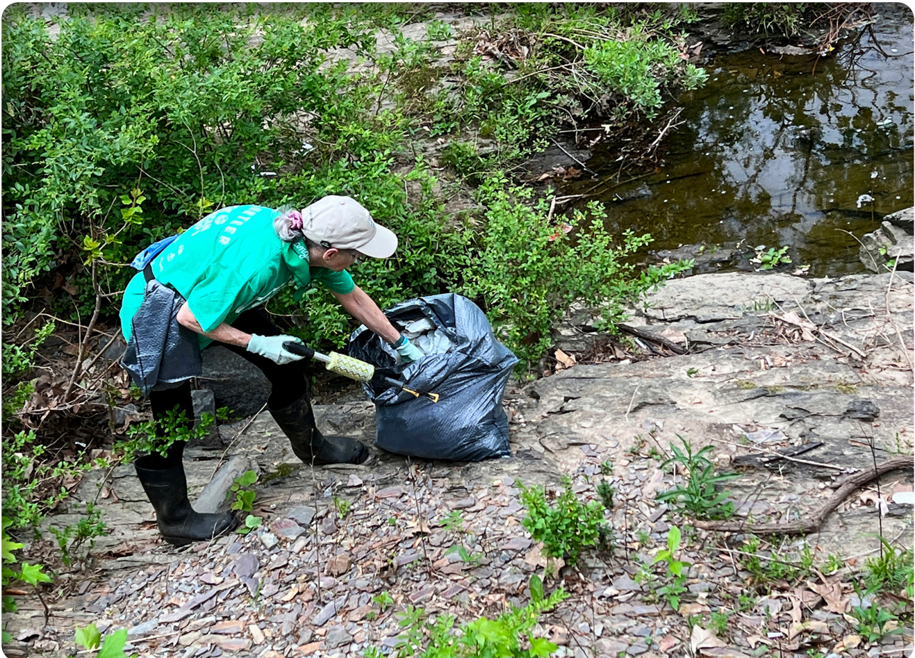
A woman picks up trash along a stream.