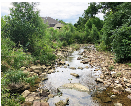
A vegetative/riparian buffer on a streambank and out for a distance in the associated riparian area is good for water quality, wildlife and prevention of streambank erosion.

The width of the riparian buffer indicates the functional ability of a riparian area to filter pollutants from runoff, shade the stream, provide wildlife habitat and prevent streambank erosion.