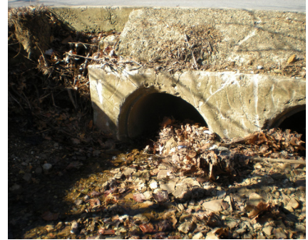
Culverts can clog with woody debris, trash and sediment. When this occurs, water flow can be blocked and aquatic wildlife movement can be limited.