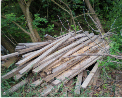
Materials stored at the edge of a streambank will be washed into the creek during a flood.

The floodplain is the location where sediment and energy are deposited and released as the water flows out of the stream channel when there is a flood. If personal property is located or stored within a floodplain, it can become damaged or lost and contribute to stream pollution as it contacts the floodwaters.