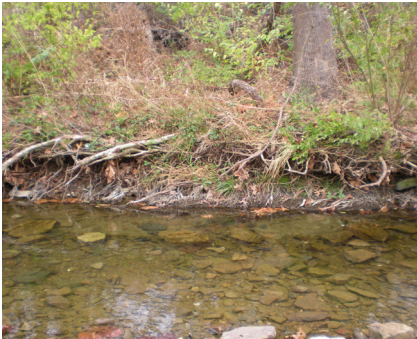
A healthy-looking stream that has no visible signs of water pollution.

In many cases, water pollution can be seen or smelled, but water pollution is sometimes undetectable to the eye or nose. If the water in your stream looks clear and you have not seen any fish kills, had an illness occur after direct contact with the water, seen raw sewage or read about potential pollution to the water from a reputable source, then you likely don't have any water pollution in the stream.