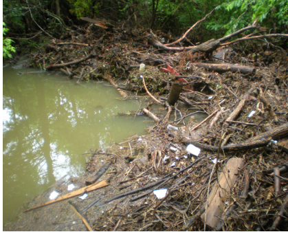
Woody debris can sometimes collect and form a river-wide blockage. These blockages will oftentimes alter a stream channel by diverting water.

Barriers to fish and water flow can prevent the easy passage of aquatic creatures up and down stream and inhibit the movement of water downstream. When aquatic creatures can't move freely up and down stream, their range, reproduction patterns and ability to move to another location with more desirable food or oxygen levels is limited. When water passage is blocked or inhibited by a low-water bridge, woody debris dam or low head dam, extreme streambank erosion or a new channel can form downstream and increased flooding can occur.