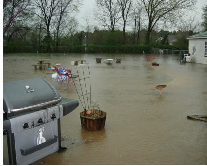
Materials stored or built in a floodplain will be washed away or damaged in a flood.