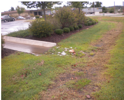
It is beneficial to deliver drainage water from a parking lot to a creek by first draining it through a bioswale before it is discharged, with riprap at the outfall of the discharge.

The drainage of water through a riparian area indicates the pollutant filtration ability of the riparian buffer and the erosive potential of drainage water being piped in from surrounding land uses.