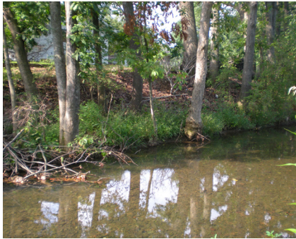
Dense and diverse vegetation on the streambank and in the riparian area is the best and most cost effective form of streambank protection.

The best kind of streambank protection is the natural protective vegetation that comes with an undisturbed or unmanicured streambank and riparian area. Roots of plants serve as natural anchors to keep streambank soil from eroding away. Usually streambanks don't need protection like riprap or other restoration measures when they have been left alone and allowed to keep their briars, bushes, vines, shrubs, trees and grasses.