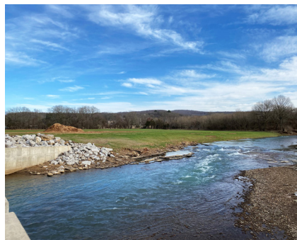
A limited vegetative/riparian buffer on a streambank and in an associated riparian area is less good for water quality, wildlife or streambank erosion prevention.