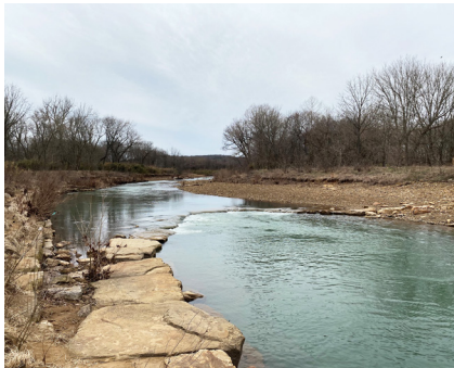
A cross vane rock structure incorporated with vegetation as part of a natural channel redesign will not likely have to be replaced.

The best erosion control measure is to leave streambank and associated riparian vegetation undisturbed. However, if the streambank and associated riparian vegetation are already gone and an unrelenting erosion problem is occurring, then an erosion control structure may be necessary.