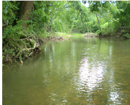
A moderately shaded stream has more dissolved oxygen content than an unshaded stream.