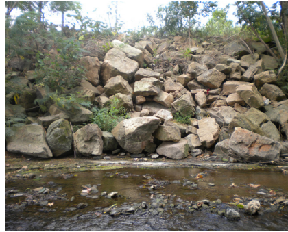
Riprap is an unsightly form of streambank protection that offers no pollutant filtration, wildlife habitat or aesthetics but can fix an unstable bank.