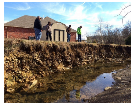
No vegetation on a streambank or in an associated riparian area is bad for water quality, wildlife or streambank erosion prevention.