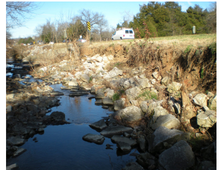
Riprap placed at the bottom of a vertical bank with no re-sloping or vegetation added will likely have to be replaced.