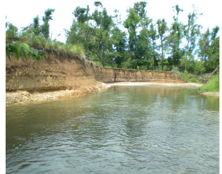
An unshaded stream has low dissolved oxygen content and a lack of desirable fish and other aquatic species.