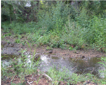
A stable streambank has a lot of dense and diverse vegetation and is usually not a vertical bank.

The stability of a streambank is measured by its rate of erosion. A streambank that erodes by an inch annually is most often not a problem, but a streambank that erodes by several inches to several feet per year is a serious problem that degrades water quality, wildlife habitat, property value and is usually very costly to fix.