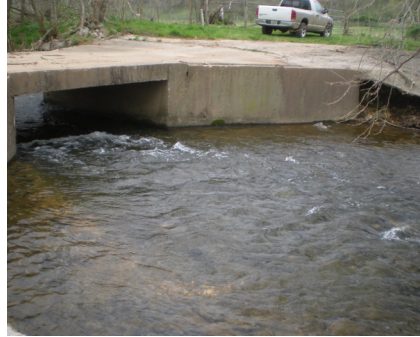
Low-water bridges installed without proper design can often block or limit both water flow and aquatic life movement up and down stream.