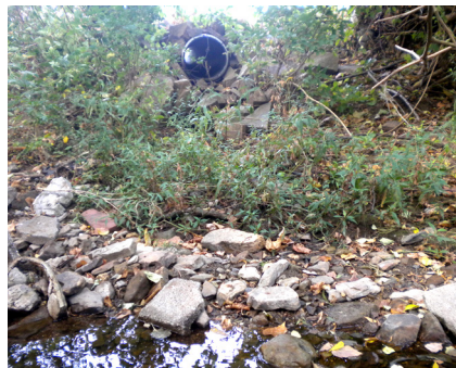
Drainage water delivered to a creek by pipe should have riprap protection around it and, if possible, should have to run through riparian vegetation before entering a stream.