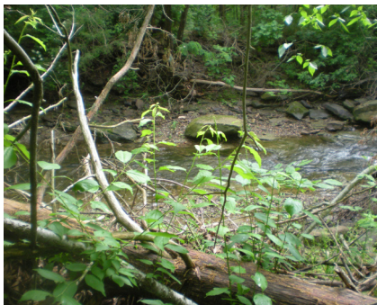
A vegetative/riparian buffer that is wide, diverse and dense with plants is much more healthy and likely to have more wildlife present.

Wildlife habitat is indicated by the width, diversity, density, health and presence or absence of the riparian area and the presence or absence of wildlife.