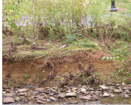
A moderately stable streambank has some vegetation and may or may not have a vertical bank.