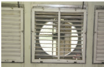
Frequent fan cleaning will reduce air flow resistance.

wear. A worn belt that rides slightly lower in a pulley is similar to using a pulley that is ½ inch smaller in diameter. A smaller-diameter fan pulley results in low rpm of fan blades. How can you tell a worn fan belt?