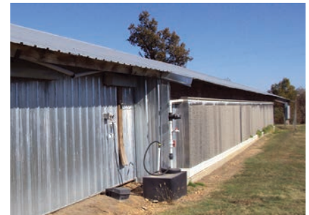
Cleaning evaporative cooling pads keeps a tunnel house in good working order.

wear. A worn belt that rides slightly lower in a pulley is similar to using a pulley that is ½ inch smaller in diameter. A smaller-diameter fan pulley results in low rpm of fan blades. How can you tell a worn fan belt?