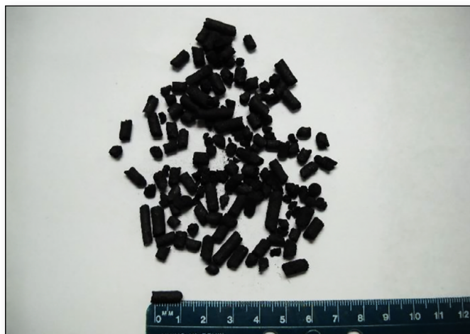
Figure 3. Pelletized poultry litter biochar. Ruler shown for scale.

“fertilize the soil”, biochar has the possibility to remain a stable source of nutrient retention (Mullen et al., 2010) for successive growing seasons without undergoing loss mechanisms such as volatilization and denitrification. This nutrient retention can also have an impact on soil test results and fertilizer recommendations for an individual growing season. In particular, the amount of fertilizer applied before and/or during the growing season may be substantially decreased (Renner, 2007) thereby reducing production costs.