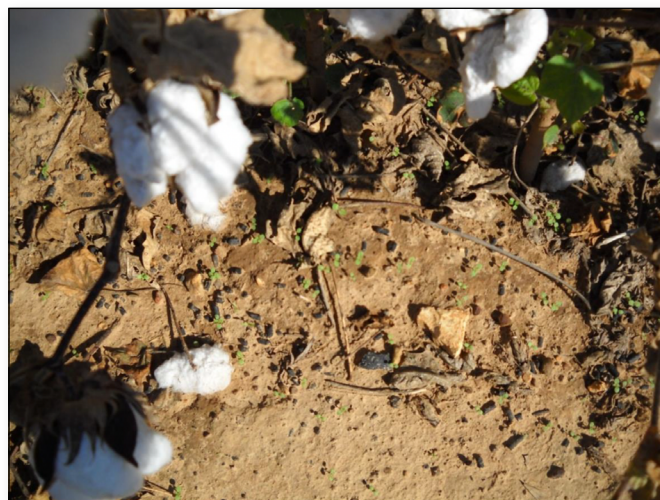
Figure 4. Field-applied poultry litter-based biochar in a cotton trial at the University of Arkansas Agricultural Experiment Station in Fayetteville, Arkansas. Biochar pellets are seen on and embedded in the soil surface.

Agricultural Experiment Station in Fayetteville that used rates equivalent to 2,000 and 4,000 kilograms per hectare (kg/ha) (Burke, unpublished data). Biochar has also been used in greenhouse experiments with radish (Allen, 2014) and in field trials with corn (Brantley et al., 2014), both at rates equivalent to approximately 5,000 and 10,000 kg/ha at the University of Arkansas. Although these studies found benefits to using biochar in crop production, there remains no state recommended biochar application rates due to the complexities of the pyrolysis process, the individual chemical and physical characteristics of a chosen biochar source and the inherent spatial variability of Arkansas soils.