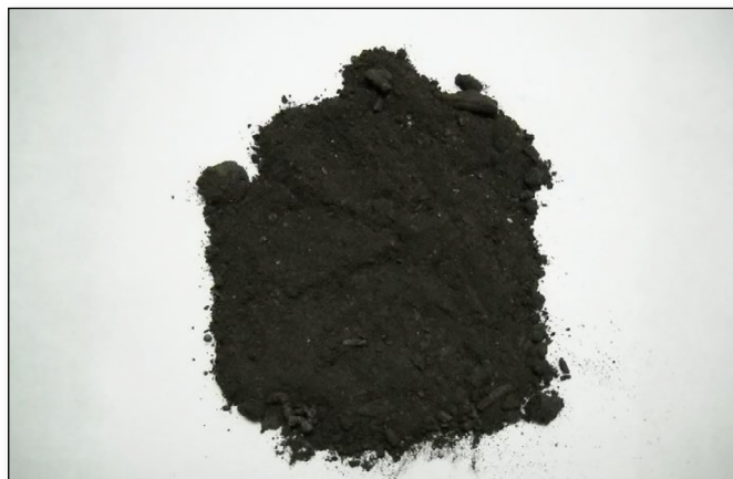
Figure 2. Granular-textured biochar from a mixed- hardwood species.

Biochar's longevity in the soil can provide numerous benefits in terms of fertility, structure and overall health (Barrow, 2012). As a part of the agronomic philosophy,