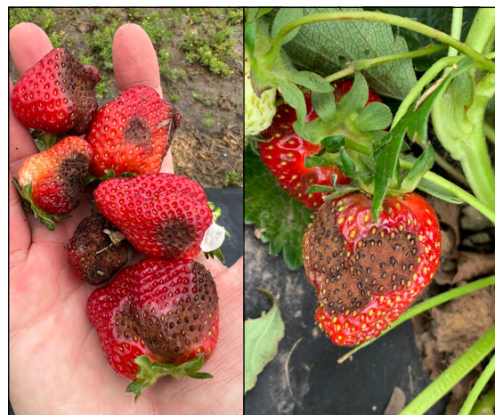
Figure 3. Anthracnose fruit rot lesions on strawberries.

Anthracoise fruit rot can be caused by the infection of three different species of fungi Colletotrichum acutatum , Colletotrichum gloeosporioides and Colletotrichum fragariae , although most fruit rot infections observed in the Southeast were historically thought to be caused by C. acutatum 8,9 . Recent publications have revealed that C. acutatum is actually a species complex containing C. nymphaeae and C. fioriniae that impact strawberry, with C. nymphaeae being the main cause of disease we observe 10 . Spores from this fungus can infect any part of the strawberry plant but infection of fruit is largely responsible for the economic losses caused by this fungus (Figure 3). Anthrac-