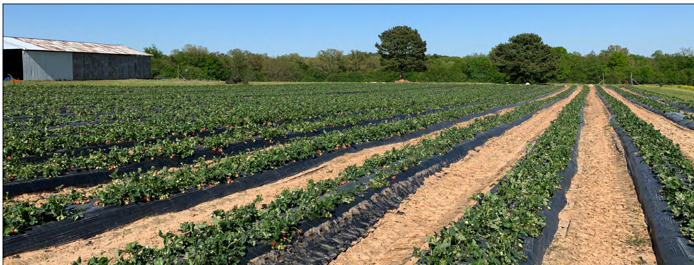
Figure 4. Strawberries growing in an annual plasticulture production system in the Southeast.

plasticulture system, new plants are transplanted every year in the fall. After spring harvest, plants are killed and removed from the field. This allows for crop rotation with crops that are non-hosts to strawberry diseases. This practice can cause a break in pest cycles and reduce the pathogen population in the field 12 . It is generally recommended to allow 1-3 years between planting of strawberries in the same field and to utilize non-related crops or cover crops when not growing strawberries in these areas. Growing plants on a raised bed, in full sun, with adequate spacing and weed control will help decrease the risk of infection as air circulation is increased, which helps to facilitate the drying of plant tissue. Additionally, plants and developing fruit are elevated above most standing water when grown on a raised bed, which helps reduce the risk of infection of fruit rot diseases.