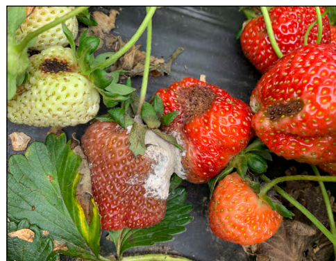
Figure 1. Strawberry fruit infected with Botrytis (grey or white mold) and anthracnose (brown sunken lesions).

Preemptive measures are necessary to prevent significant yield losses from Botrytis and anthracnose fruit rot. While there are several practices that can help lower the incidence and spread of the causal pathogens, cultural practices used alongside fungicide applications will be needed to achieve sustainable management of these diseases. An effective and sustainable fungicide program should be based on an understanding of the life cycle of the targeted pathogen. This will enhance the effectiveness of a program's preventive control through improved application timing, selection of fungicides with high efficacy against the targeted pathogen, as well