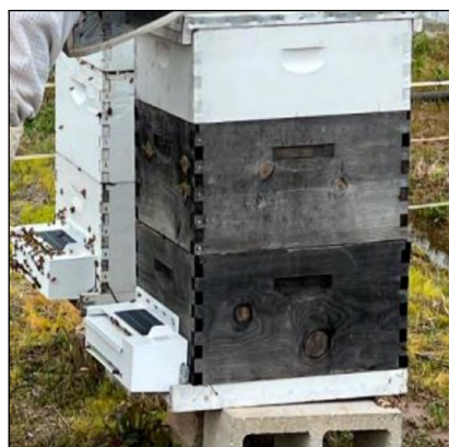
Figure 6. Hives equipped with a biocontrol agent dispenser.

several effective cultural practices, such as high tunnels, can help improve the effectiveness of an organic fungicide program 13,19 .